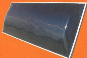
SOLAR AIR COLLECTORS