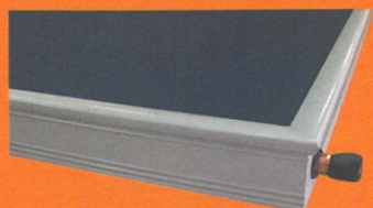
FLAT PLATE SOLAR THERMAL COLLECTORS